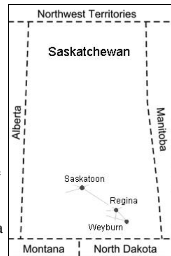
Map of Saskatchewan, showing Saskatoon, Regina and Weyburn

The results of our collaboration in this project will no doubt be of interest to many of our Sponsors and lead to further research developments in seismic exploration. We will keep you posted as and when they happen.